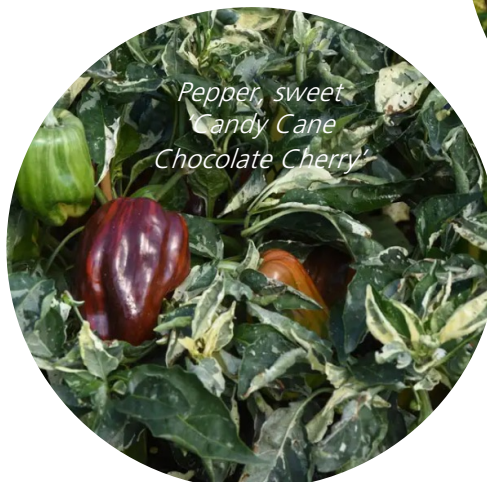
Pepper, sweet 'Candy Cane Chocolate Cherry'