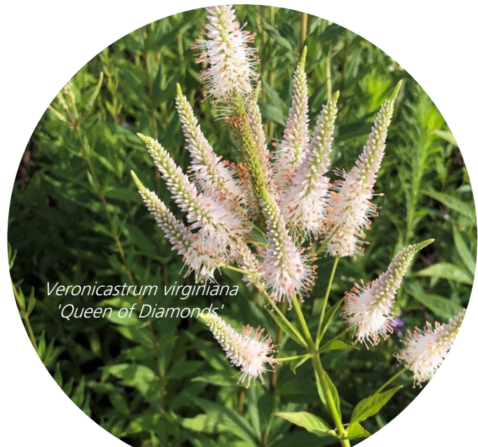
Veronicastrum virginiana 'Queen of Diamonds'