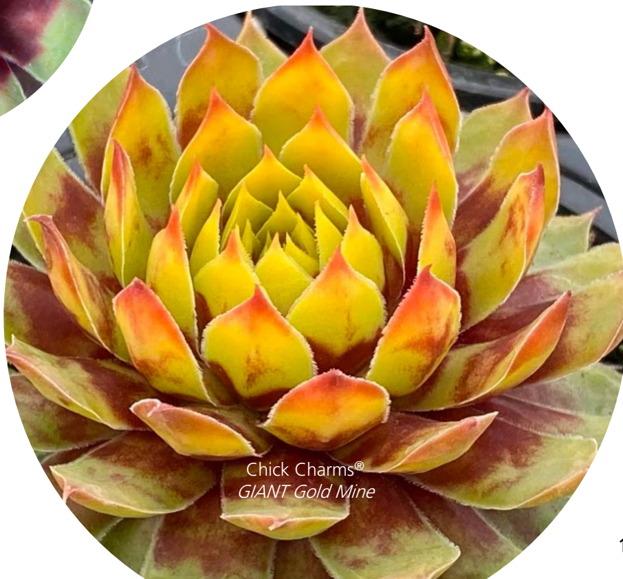
Chick Charms® GIANT Gold Mine