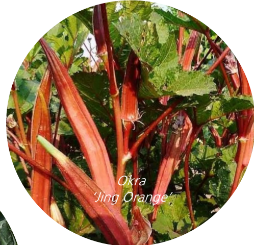
Okra 'Jing Orange'