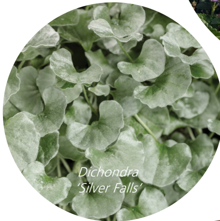
Dichondra 'Silver Falls'