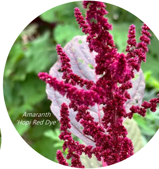
Amaranth 'Hopi Red Dye'