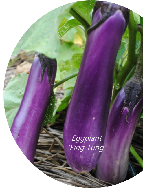
Eggplant 'Ping Tung'