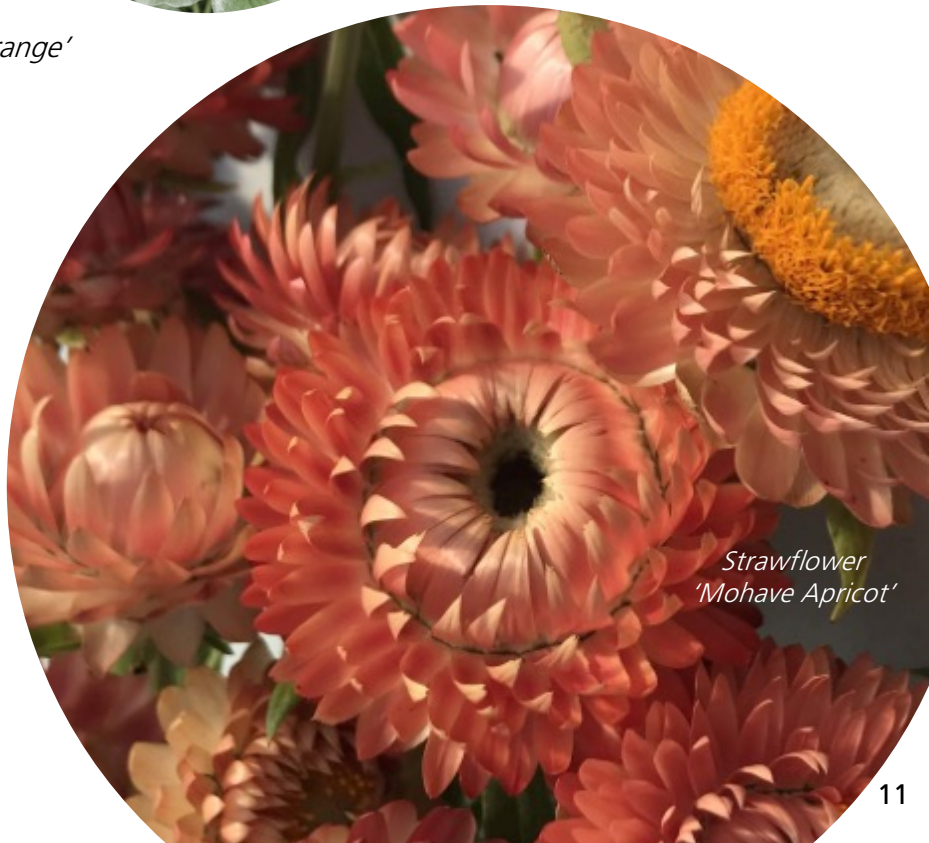
Strawflower 'Mohave Apricot'