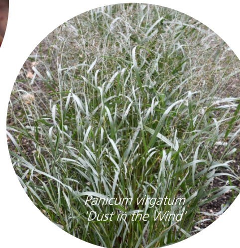
Panicum virgatum 'Dust in the Wind'