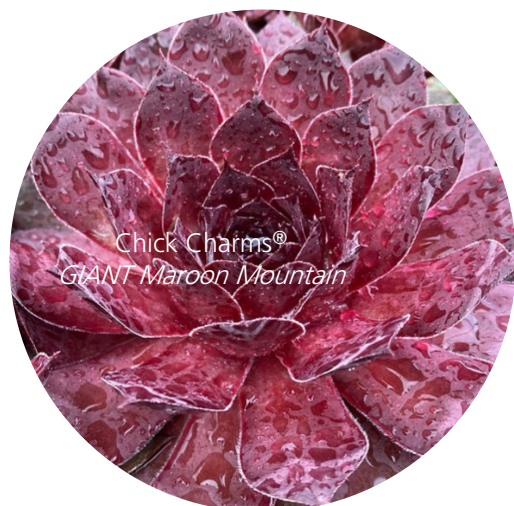
Chick Charms® GIANT Maroon Mountain