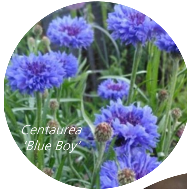
Centaurea 'Blue Boy'