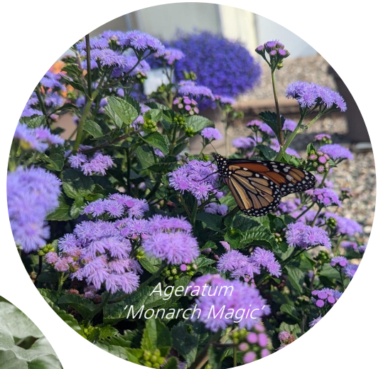
Ageratum 'Monarch Magic'