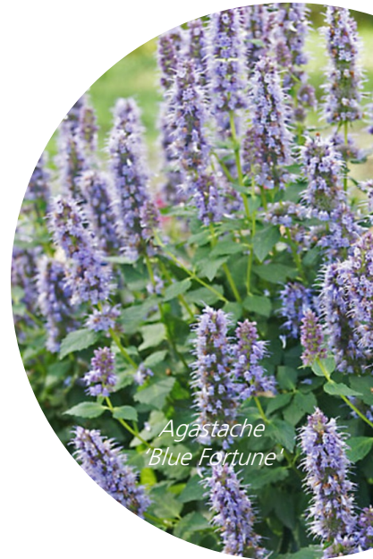
Agastache 'Blue Fortune'

Geum 'Wet Kiss' Helianthus 'Lemon Queen' Heliopsis helianthoides 'Bleeding Hearts' Iris versicolor 'Purple Flame' Lavandula angustifolia 'Hidcote' Leucanthemum superbum 'Snowcap' Liatris spicata 'Kobold' Linum perenne 'Blue Sapphire' Lobelia cardinalis Lobelia siphilitica 'Blue Select' Lysimachia lanceolata 'Burgundy Mist'