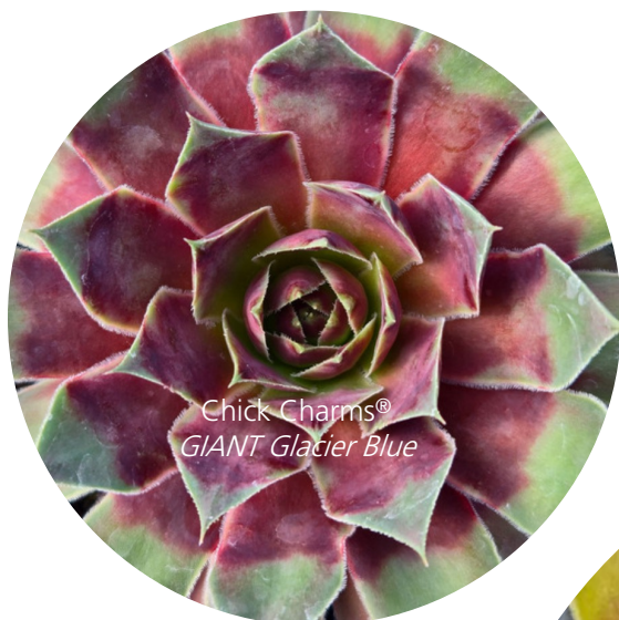
Chick Charms® GIANT Glacier Blue