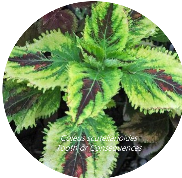
Coleus scutellarioides 'Tooth or Consequences'