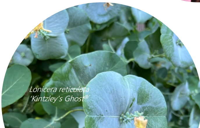
Lonicera reticulata 'Kintzley's Ghost®'