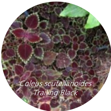
Coleus scutellarioides 'Trailing Black'