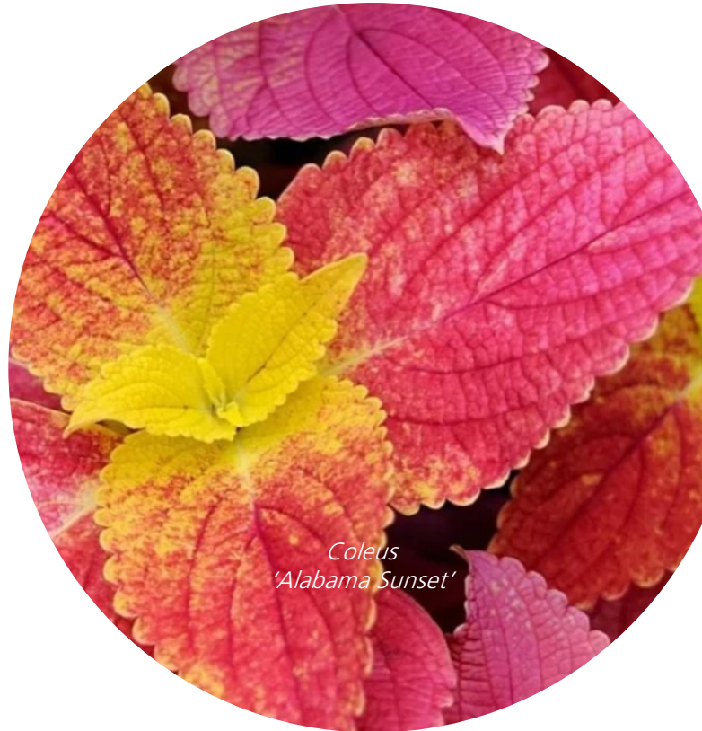
Coleus 'Alabama Sunset'