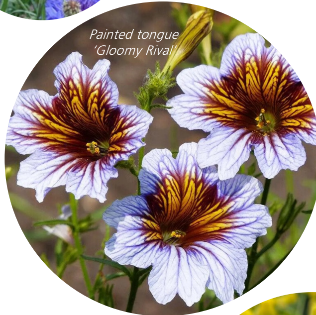
Painted tongue 'Gloomy Rival'