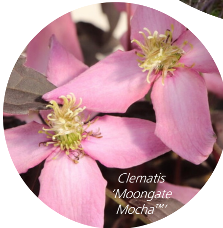
Clematis 'Moongate Mocha™'