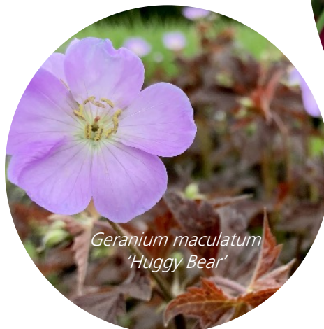
Geranium maculatum 'Huggy Bear'