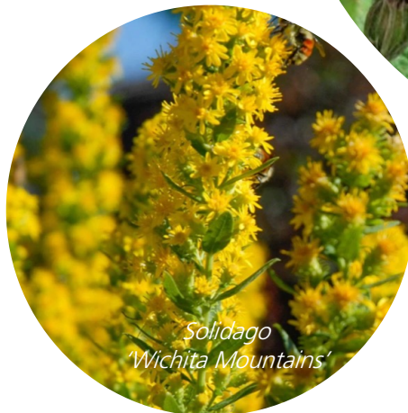
Solidago 'Wichita Mountains'