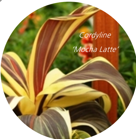
Cordyline 'Mocha Latte'