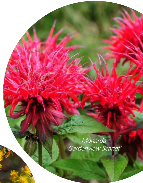
Monarda 'Gardenview Scarlet'