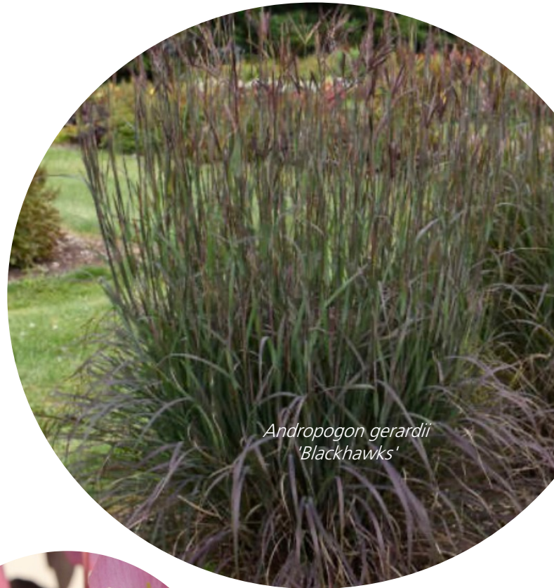
Andropogon gerardii 'Blackhawks'