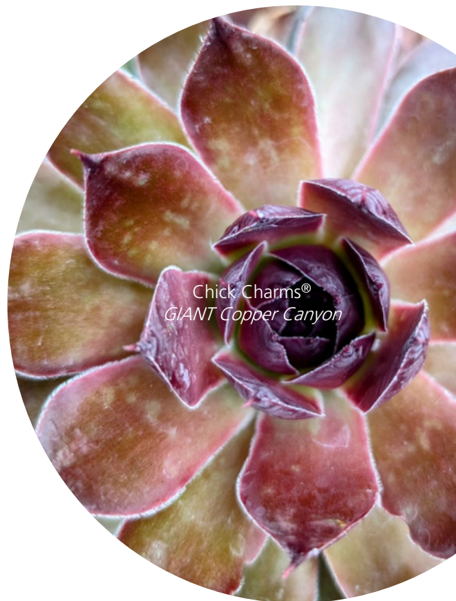
Chick Charms® GIANT Copper Canyon